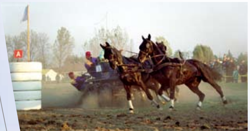
Equestrian Days in Jászkarajenő

Ceglédbercel (E/7) has a Village Museum and some good fishing at the settlement border. The town is situated in the Kunság wine region , and its equestrian centre and horse-jumping events also attract visitors. Lovers of horse sports will also enjoy a warm welcome at Jászkarajenő (F/8) and Kocsér (F/9).