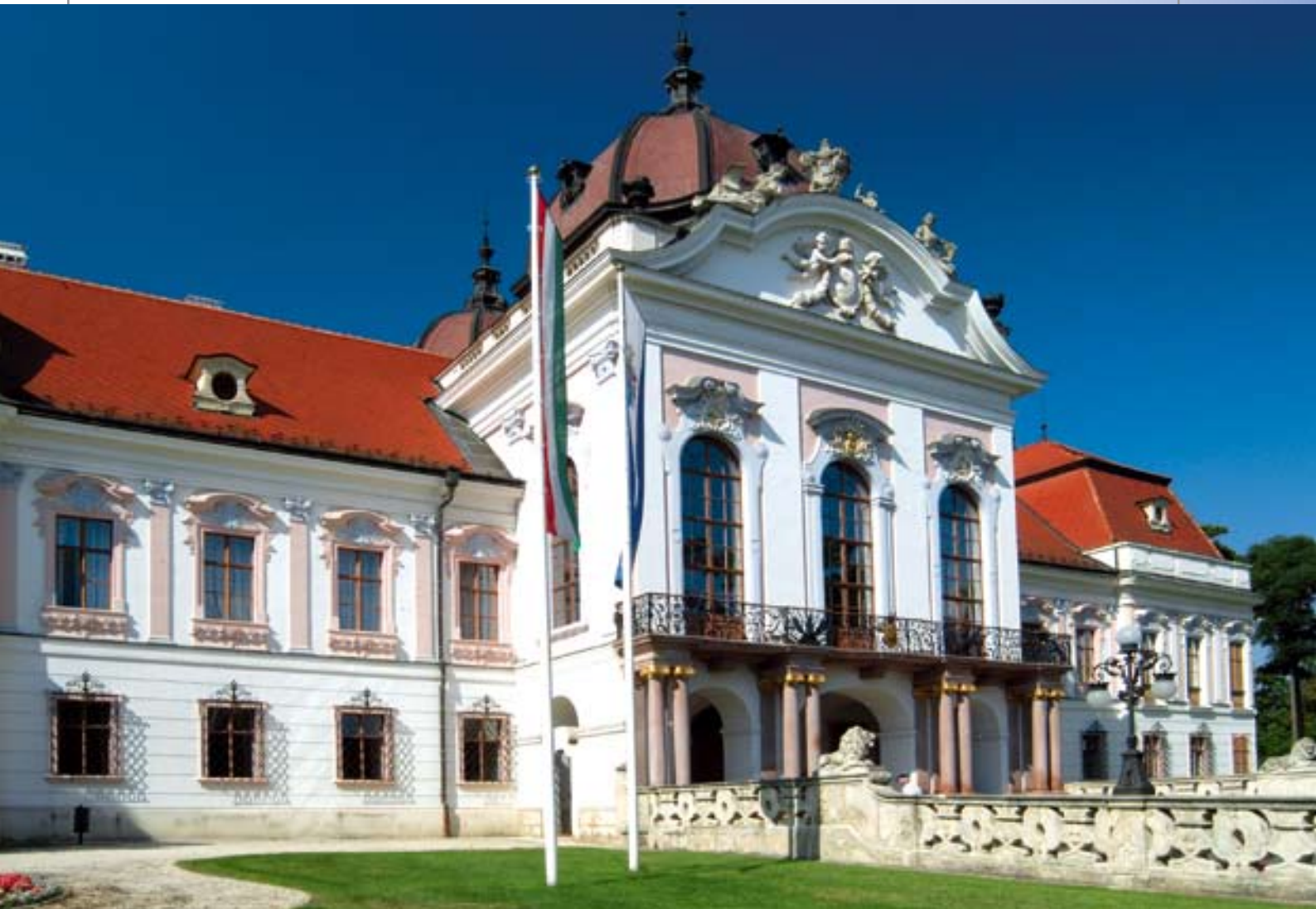
Gödöllő Royal Palace

Leaving the mountains, we can see an area of plains and smaller hills (250–350m) between Fót and Mogyoród, and the Gödöllő Hills covered with loess on sand. These hills form a Nature Preservation Area. The hunting here is also legendary, and used to be a favourite of kings, governors and party presidents. Today, carefully chosen tourist paths guide “ordinary people” across the region. The area can be reached by car via the M3 highway or on slower byways; alternatively you can take the Gödöllő HÉV or other trains that leave from Budapest Eastern Railway Station.