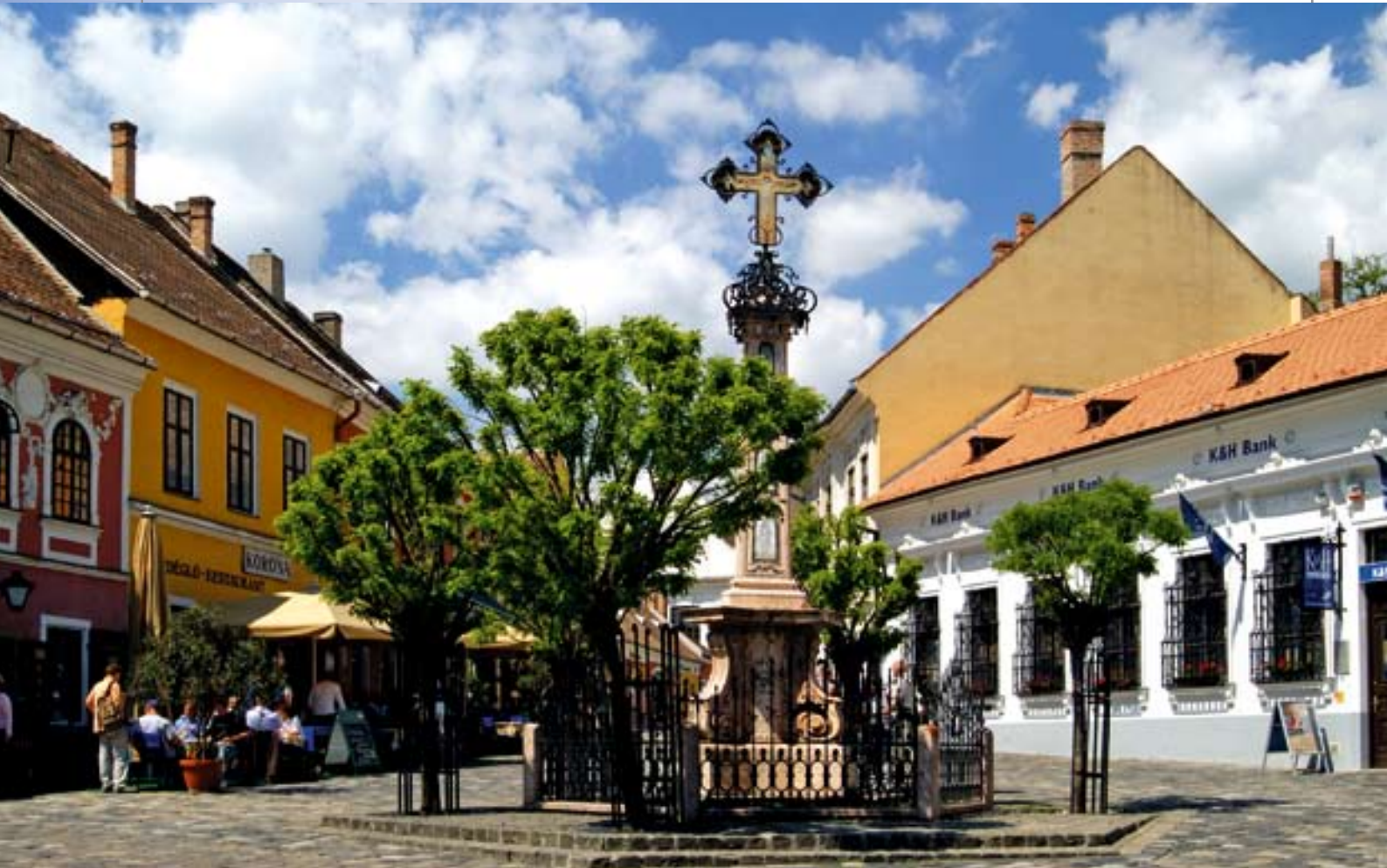
Szentendre, Main Square

The landscape to the north of Budapest is shaped by the river and the hills. You can easily get out into the countryside along the winding main road that follows the former Roman Limes, or by taking one of several cycling routes that are being constructed. But the best way to appreciate the river and its sights is to board a boat travelling from Budapest through the Szentendre Danube branch as far as Visegrád.