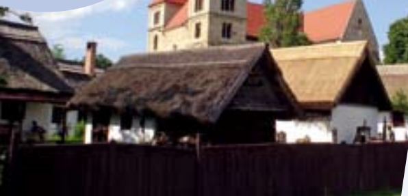
Ócsa, Open Air Museum