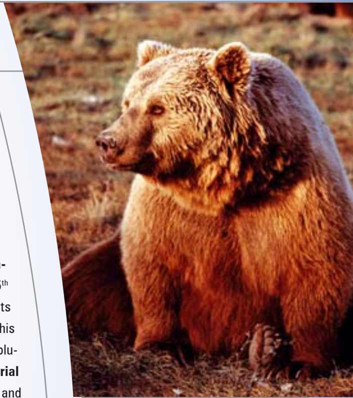
Veresegyház, bear asylum

Going southwest towards Budapest, we come across Kerepes, Kistarcsa, Nagytarcsa and Csömör (C/6) . These settlements conserve their distinct cultures and values. You can visit the Village Museum (Nagytarcsa), and take part in local celebrations such as the Kistarcsa Days or the famous Lord's Day Procession at Csömör*** , when the streets around the church are covered with a carpet of flowers. Also consider the traditional Pentecostal Festival and the Feast Meeting .