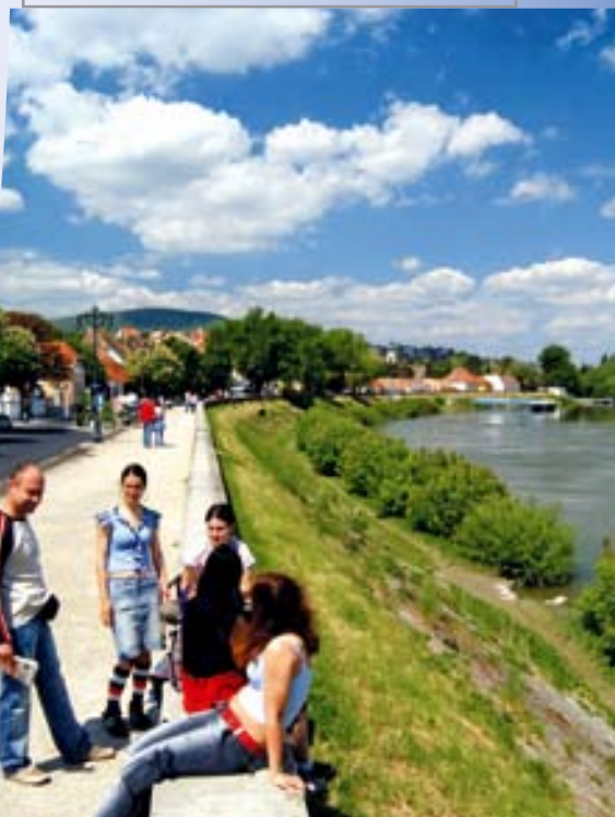
Szentendre, Danube shore