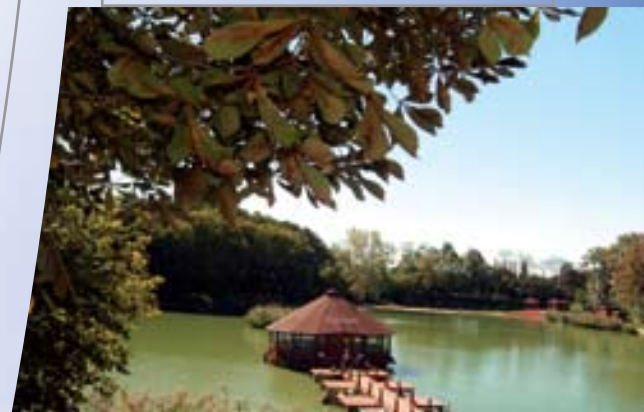
Gyömrő, lake bath