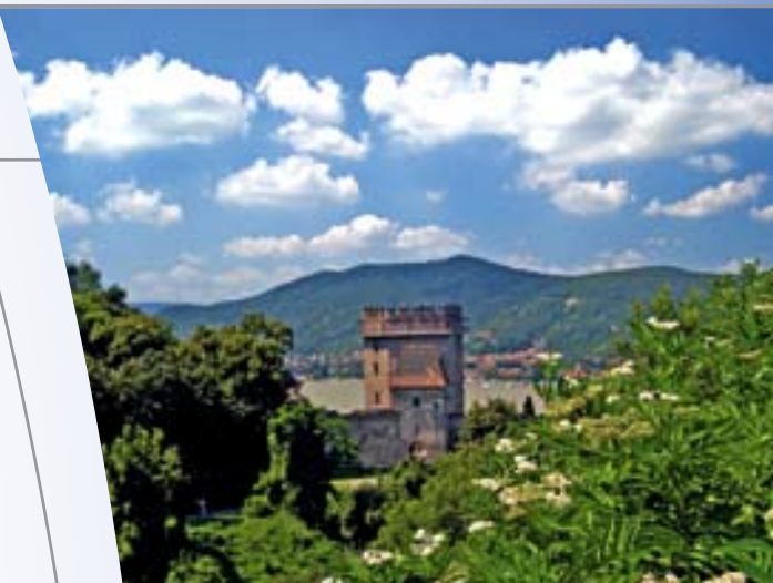
Visegrád, Solomon's Tower

As the narrow river valley broadens once more, you'll arrive at one of the most picturesque Danube settlements – the former capital of Hungary, Visegrád (B/4)*** . Here is the royal palace*** , built in the 14 th century by King Charles Robert (Róbert Károly) and reconstructed in Renaissance style in the 15 th century by King Matthias. The palace remains in perfect condition, and is famous throughout Europe. Fellegvár (Upper Castle) was built in the 13 th century on the hill above Visegrád. It played an important role in the city's history at times of peace and war alike. You can enjoy the Danube Bend's most beautiful panorama*** from the terrace of the castle. The third part of the monument complex is Solomon's Tower , a residential fortification built in the 13 th century; today it is a venue for exhibitions. Stay a little longer and pay a visit to the Tourist Centre and Yurt Camp on Sibirik Hill , shoot down the summer and winter bob-sleigh track , have a go at mini golf and join one of the countless marked tourist paths . When there's winter snow, grab your skis and try the ski lift at the nearby Nagyvillám. The neighbouring Park Forest of Pilis is an important hunting range , as well as being popular with hikers.