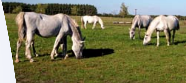
Tápiószentmárton, Kincsem equestrian park

On leaving the Ethnography House , we can proceed along the Fehér gólya (white stork) study path , and then take a comfortable dirt road. Our goal is Tápiógyörgye (F/7) , where we find the Györgye residence with its protected park *** (you need to ask for a permission to enter). The old teachers' house is the home of the Village Museum . Unsurprisingly, there's yet another thermal bath where we can enjoy some rest and recuperation.