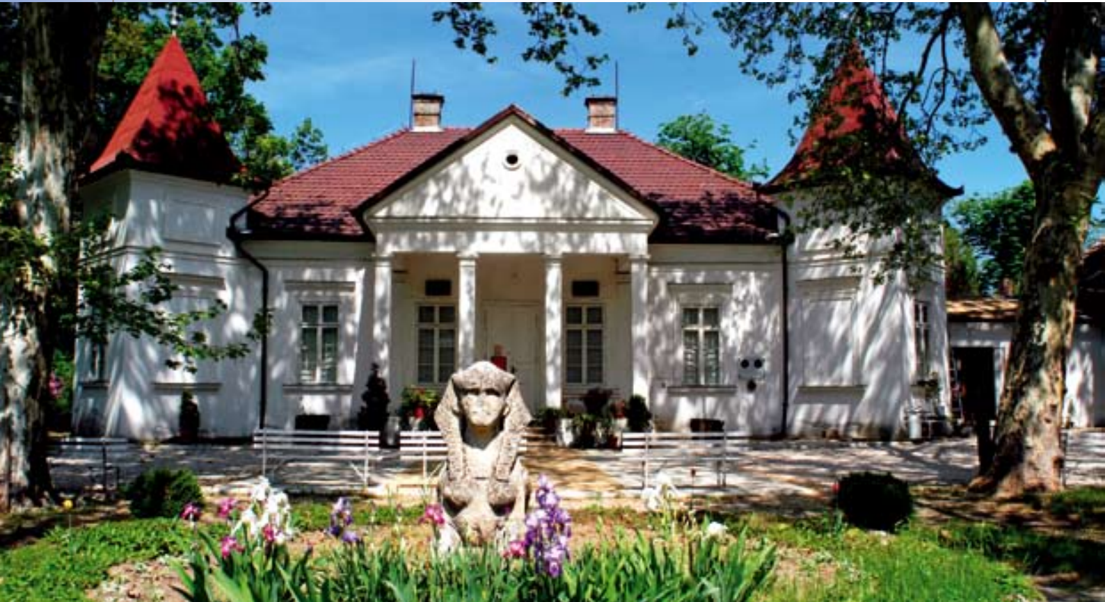
Tápiószéle, Blaskovich Museum

At the point at which the Great Plains and the Gödöllő Hills meet to the east of Budapest, there is an area still unknown to tourists. The landscape is dominated by hills fashioned by the Ancient Danube which flowed in a northwest–southeast direction. The hillsides contain valleys and plains typical of the Great Plain area. The upper and lower branches of Tápió Creek join together at Tápiószentmárton and flow into Zagyva.