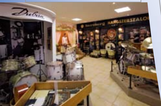
Cegléd, Drum Museum

Prince Árpád started out on his conquests. On the hill made famous by the poem we can see the Millennium Memorial , built in 1896 to commemorate the historic event.