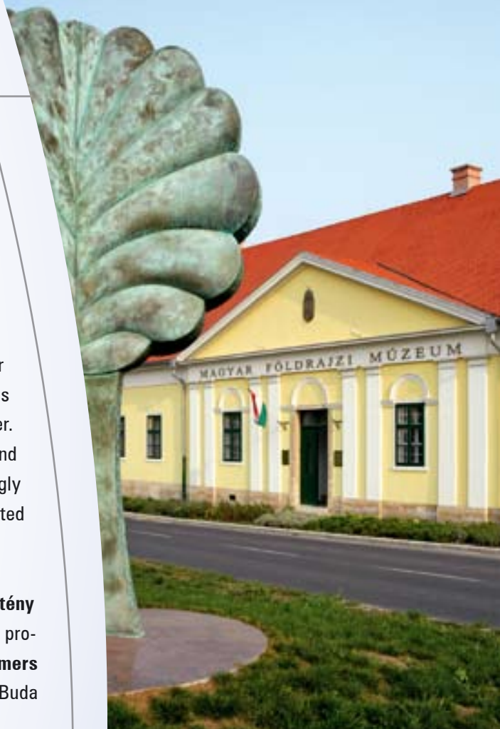
Érd, Hungarian Geographical Museum

The Benta Creek Valley, north of Érd, is characterised by limestone and sandstone rocks. The stone mines of Sóskút (B/6) provided the raw material that went into Budapest’s most famous buildings (Parliament, the Opera House, etc). The sheer size of the abandoned stone mines is quite astonishing. The Equestrian Club is a favourite of local riders and a venue for many races.