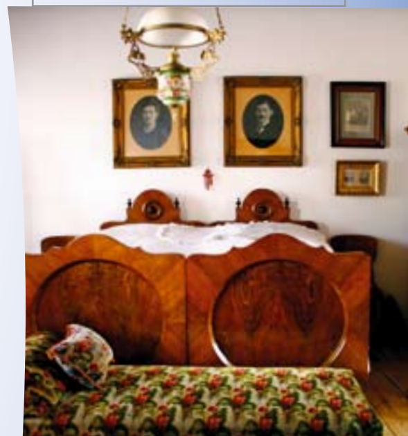
Szentendre, Open Air Museum, room interior