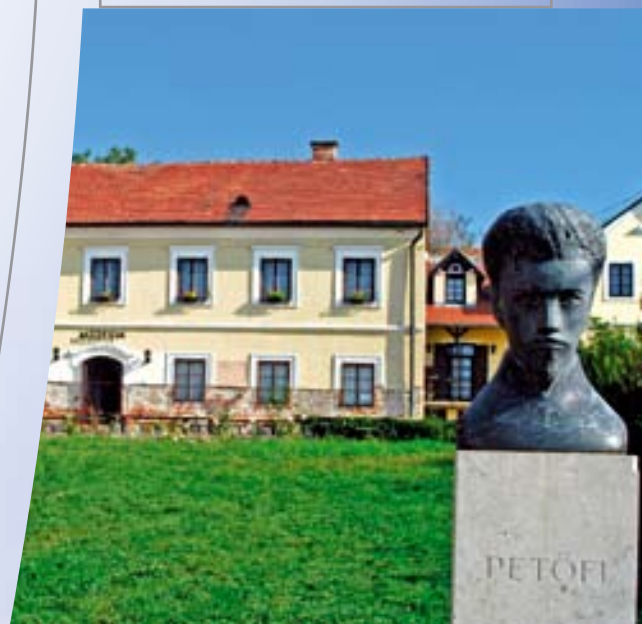
Aszód, Petőfi Museum