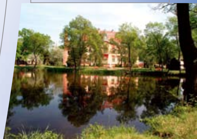
Tápiógyörgye, protected park of the Györgye residence