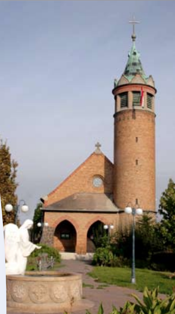
Monor, evangelical church

Pilis (D/7) – not to be confused with the hill of the same name – once lent its name to the entire county. The “plain” Pilis is where one of the rare Great Plain springs originates – Gerje Creek . The spring flows into the River Tisza; at its source there is a vast nine-acre park with three lakes and a lovely promenade. Artificial islands sit at the centres of the lakes, and are home to ducks, wild geese and storks. This is the site of the Mille-centenary Park , containing one of the country’s largest wooden crosses at 8.5m tall. You should also visit the 18 th -century Evangelical church , with its unique pulpit altar.