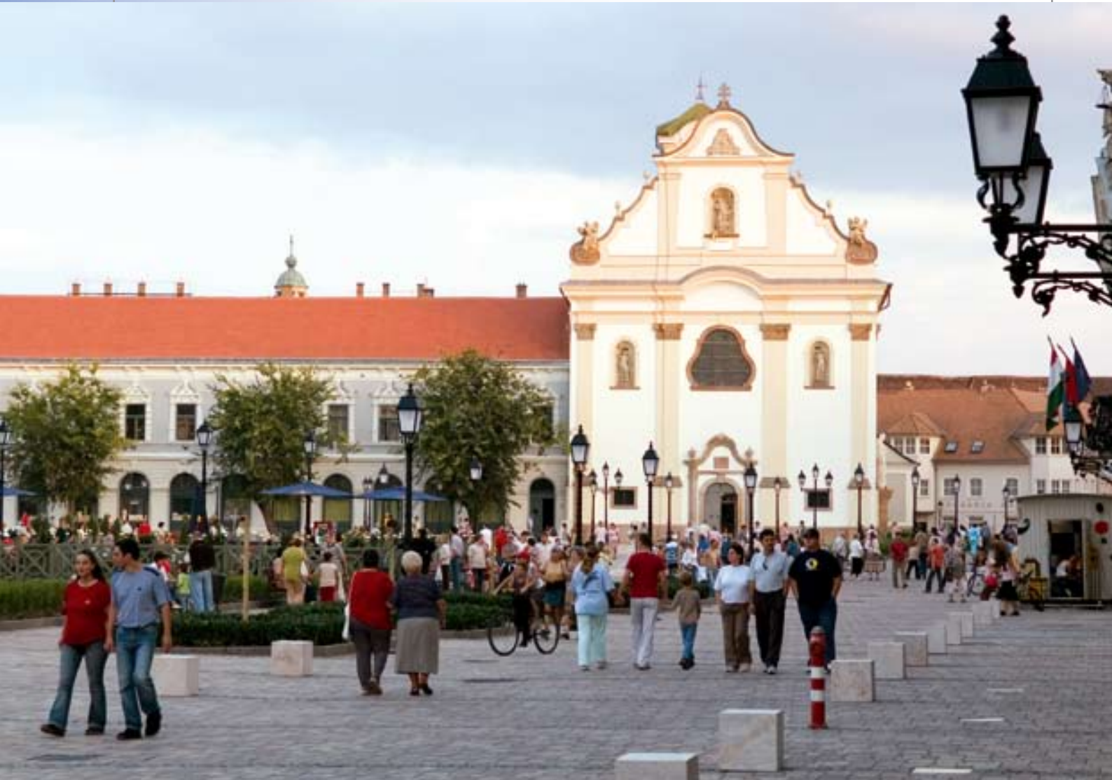
Vác, Main Square

Those living on the right-hand side of the Danube often say that the best thing about the left-hand side is the view across to the other side of the river. It is true that there are no sights to compete with Visegrád or Esztergom on the left side. However, it has worthy sights of a different sort – the Gödöllő Hills , Lower Cserhát and Galga Valley , former volcanoes (South Börzsöny, Csóvár), a limestone mine at Naszály , the Somlyó Hill of Fót (famous for its grapes), Danube oxbows with wonderful fauna and even a slice of the Great Plain .