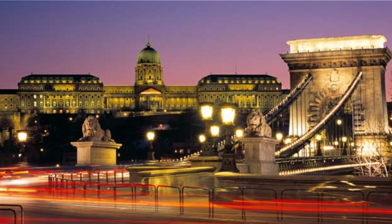
Buda Castle and Chain Bridge

When you arrive in Budapest, head to the centre and drink in the view of the city's two parts, divided by the Danube and linked by the bridges that cross it. Choose a look-out point – whether the terrace on Gellért Hill, the arcades of the Fishermen's Bastion, the Danube shore, the cupola of the Basilica or the girders of Margaret Bridge – and you'll see sights to remember forever.