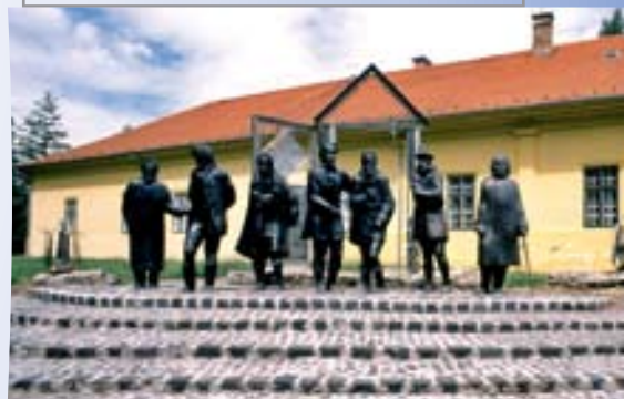
Nagykőrös, János Arany Museum