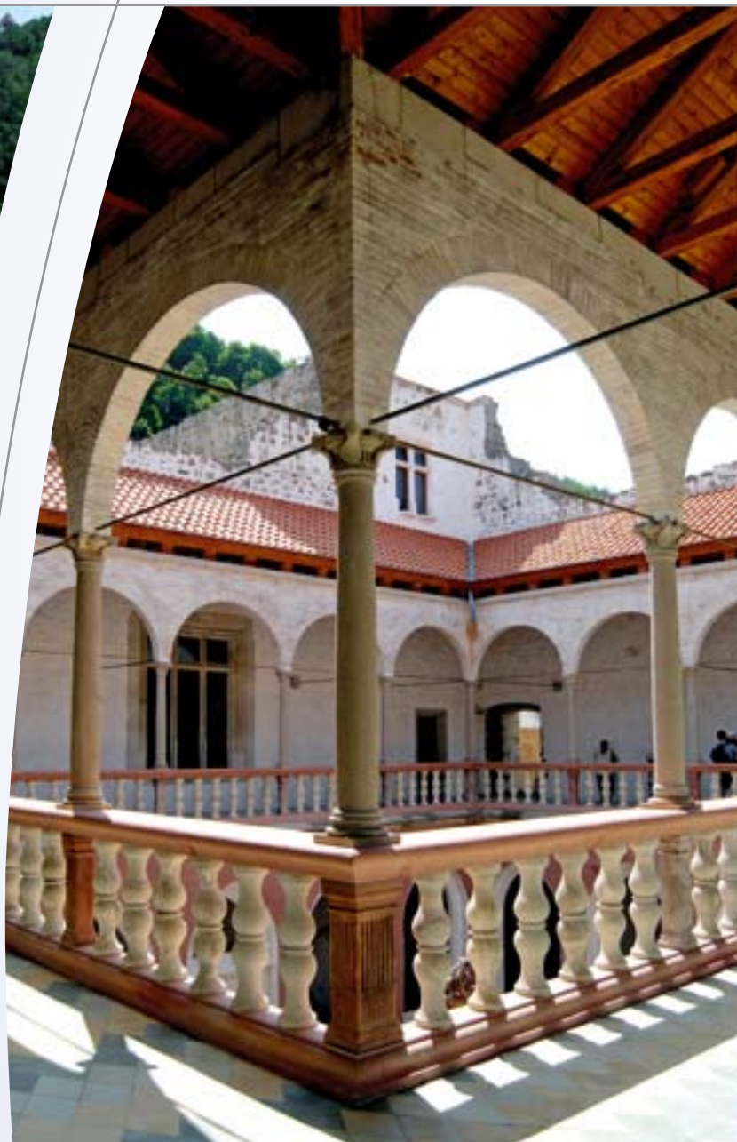
Visegrád, Royal Palace

by Germans and Slovaks. However, Pomáz is also a great starting point for trips to typical villages of the Pilis like Csobánka (B/5) (with its hill chapel), Pilisszentkereszt (B/5) (with the ruins of a 12 th -century Cistercian Abbey), and the legendary Dobogókő (B/5) *** (where, according to the Dalai Lama, “the world’s heart beats”). Many trails begin or end at Dobogókő, and there is a museum dedicated to the traditions of hiking. The Duna-Ipoly National Park region is a haven for lovers of the great outdoors. Here rock climbers can take advantage of the Oszoly Rock , paragliders can launch themselves from a hill peak, and hikers and mountain bikers can follow marked paths running through Dera Canyon , Vaskapu Strait and Holdvilág Dyke . The daring can climb down steep rock walls to reach the Danube, while families can instead make their descent along gentle valleys (such as Apátkúti Valley and Áprily Valley ).