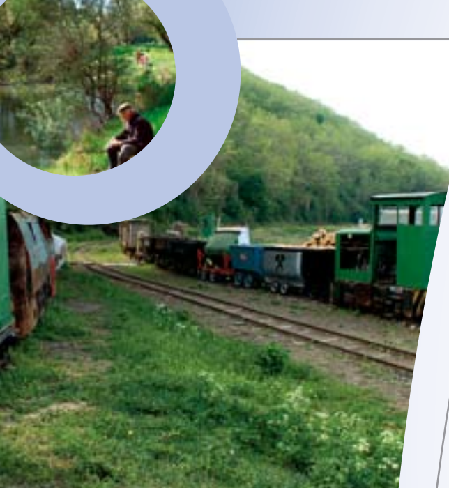
Kemence, narrow gauge railway