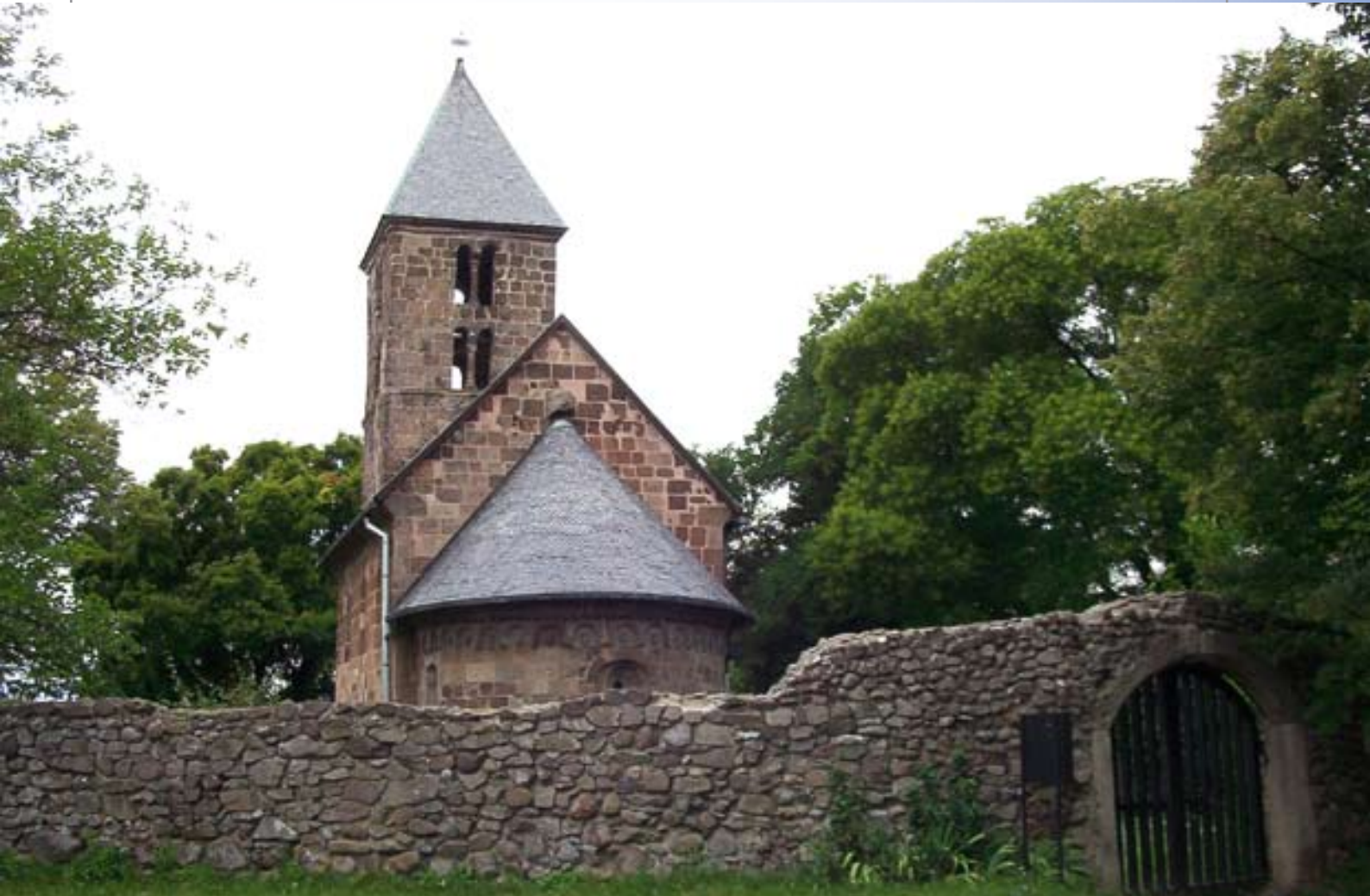
Nagybörzsöny, Saint Stephen's Church

The Ipoly (Ipel) – a river running along the border with Slovakia – is a feeder for the Danube . It embraces Börzsöny , the mountain that – together with Visegrád – characterises the Danube Bend. The volcanic, 900m-high mountain is covered with typical Hungarian woodland: oak, beech and hornbeam. The Danube-Ipoly National Park contains a diverse range of flora and fauna, including 70 protected plant species and more than a hundred protected types of bird. Snow settles for a long time on the former volcanic cone and the valleys, and the region is popular with lovers of winter sports . From spring to autumn, hikers and hunters come here, the latter for the stocks of deer and wild boar.