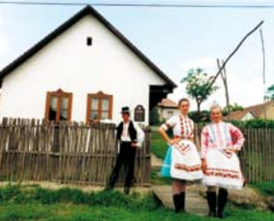
Slovak House, Bánk