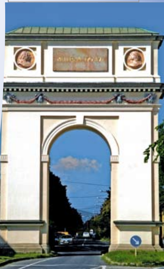
Vác, Victory Arch