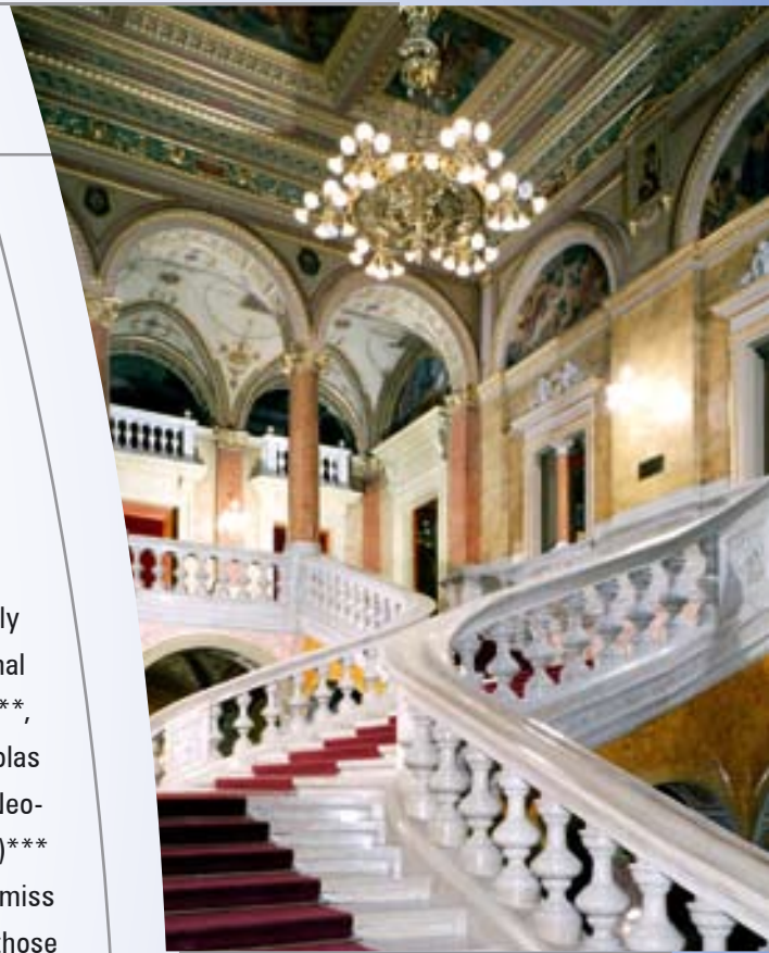
House of the Opera, interior

The city has some other rare and special features. It is, for example, the only metropolis in the world where you'll find 80 hot-water springs. The thermal water has been feeding spas here for almost 2,000 years. The Rudas*** , Király (Royal) and Császár (Imperial) spas – with their splendid cupolas – are among the few surviving examples of Turkish architecture. The Neo-Baroque Széchenyi Thermal Baths*** – located in City Park (Városliget)*** – is the biggest spa complex in Europe; however, you also shouldn't miss the Secessionist-style Gellért Baths*** . There are many options for those who prefer some active recreation. Armed with helmet and torch, you can visit some dripstone and aragonite caves*** ; alternatively, you might take a pleasant walk in the Buda Hills. There are several tourist trails and lovely parks like Margaret Island, City Park and Shipyard (Hajógyári) Island. These places can be reached on foot or along cycling routes. After you've strolled in the parks, you can go shopping on Váci Street*** or at the Westend City Center shopping hall. Finish the day off with a coffee at a café terrace or a more substantial meal at one of the many enticing restaurants.