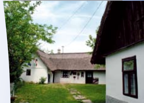
Dömsöd, Petőfi exhibition