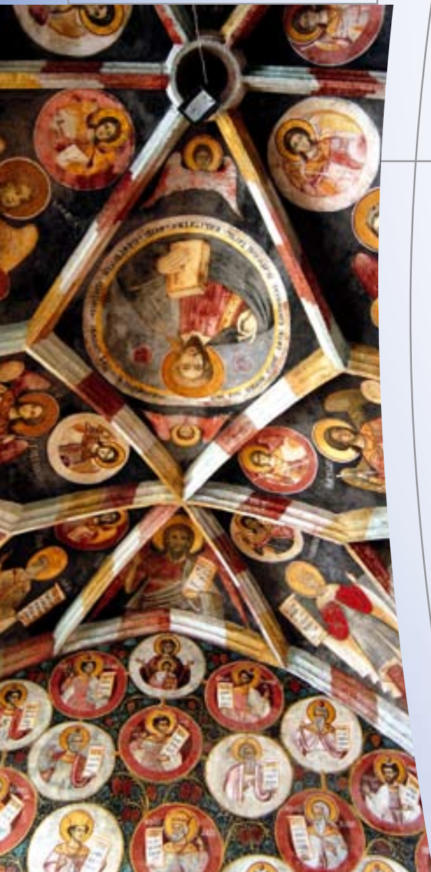
Ráckeve, Church of the Blessed Virgin