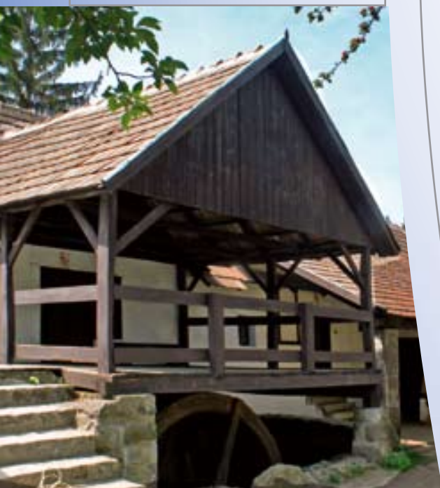
Nagybörzsöny, water mill