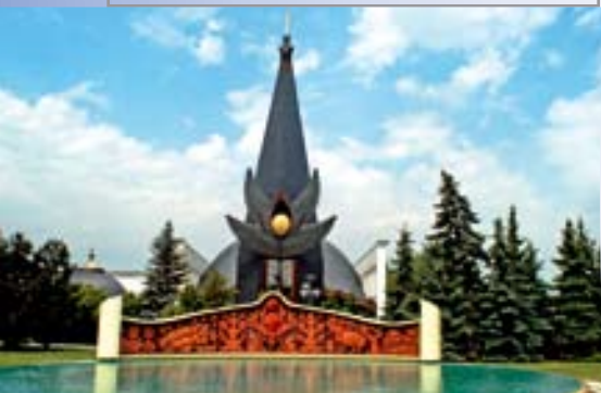
Százhalombatta, Makovecz church