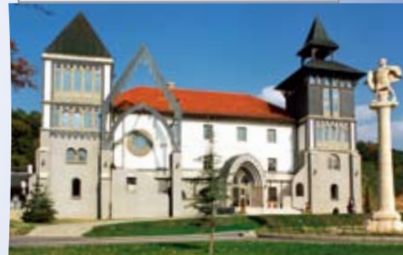
Piliscsaba, Catholic University