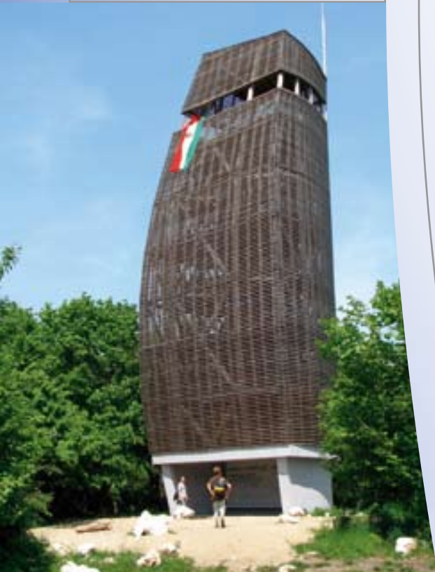
Nagy-Kopasz, Pál Csergezán lookout tower

ravages of the Turkish occupation, but was subsequently destroyed by an earthquake in 1763. The “ Saturdays of Zsámbék ” events (from June to late August) started 20 years ago. The picturesque ruins play an important role, as does the Zsámbék Theatrical Base , a theatre founded on the site of a former rocket base.