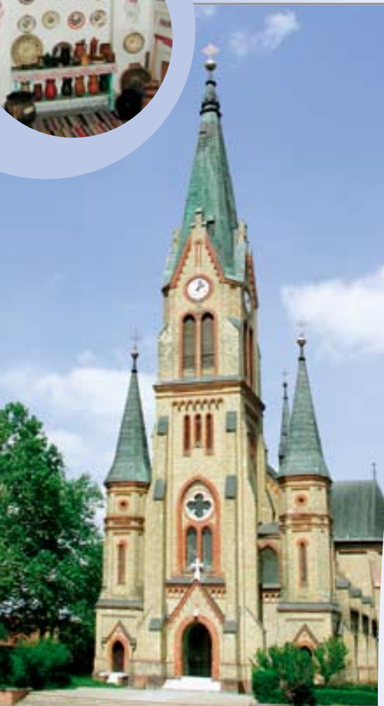
Jászkarajenő, Church of Our Lady