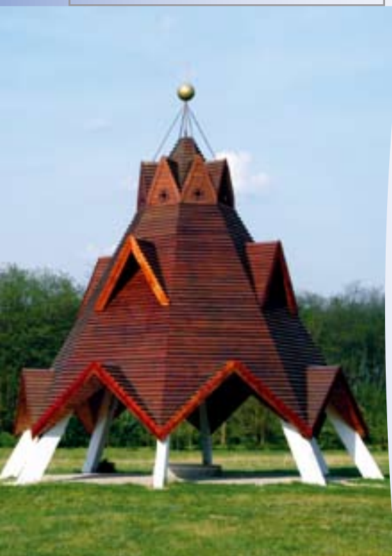
Pusztavacs, geographical centre of the country