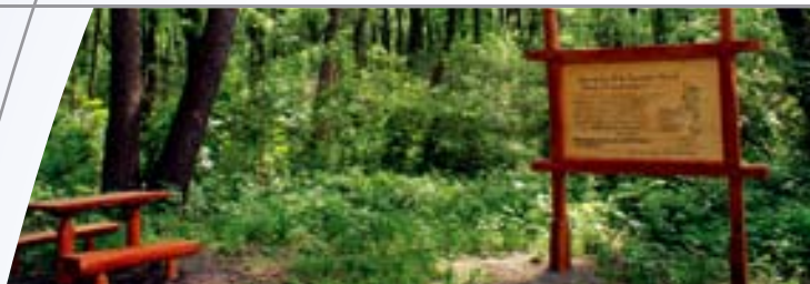
Ócsa Nature Preservation Area