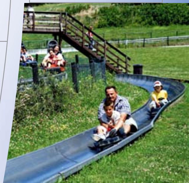
Visegrád, bob-sleigh track