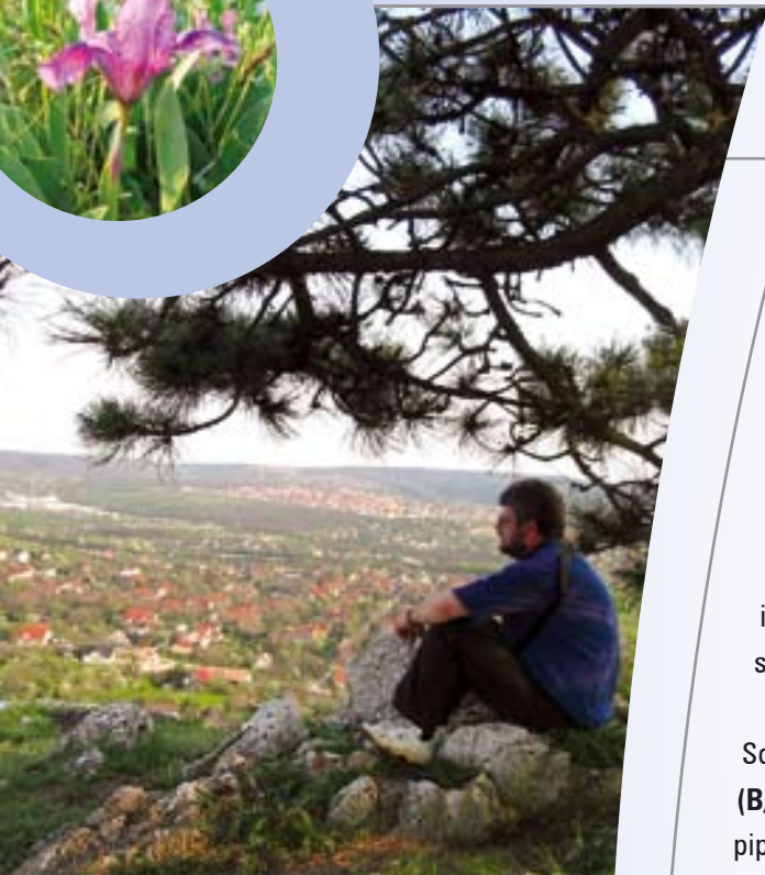
Panorama from the Csiki Hills