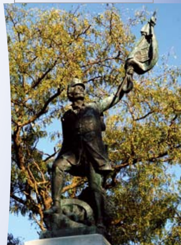
Nagykáta, Freedom fight memorial