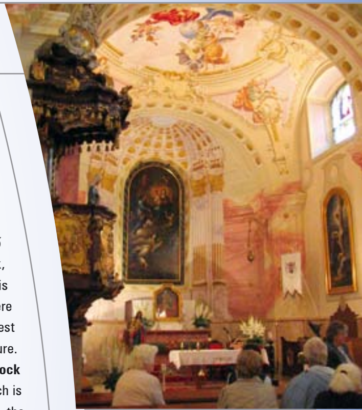
Solymár, pilgrimage church

The close proximity of the Pilis Hills is clear from the names of the surrounding settlements. The closest to the capital is Pilisborosjenő (B/5) . From this direction, you can reach the rocky hills of Kevélyek, which is home to pine groves and beech trees. Pilisvörösvár (B/5) is still occupied by descendants of the German population that arrived here in the 18 th century. There are bilingual signs, restaurants serving the best German dishes and local events that celebrate the local German culture. The small villages around it are much loved by Budapest's anglers . Rock climbers like to practise their skills on the 31m-high Ördögtorony, which is in the Buda Hills near Pilisszentiván (B/5) . The National Blue Route , the longest and best-known of the area's hiking roads, leads through Piliscsaba (B/5) . The village is famous for the Pázmány Péter Catholic University , which was founded after the regime change in 1989. The university buildings are superb examples of the organic architectural style favoured by Imre Makovecz and his workshop. The Baroque-style Roman Catholic Church in the centre of Piliscsaba – with its enormous interior – is used as a venue during the Ecclesiastical Music Days .