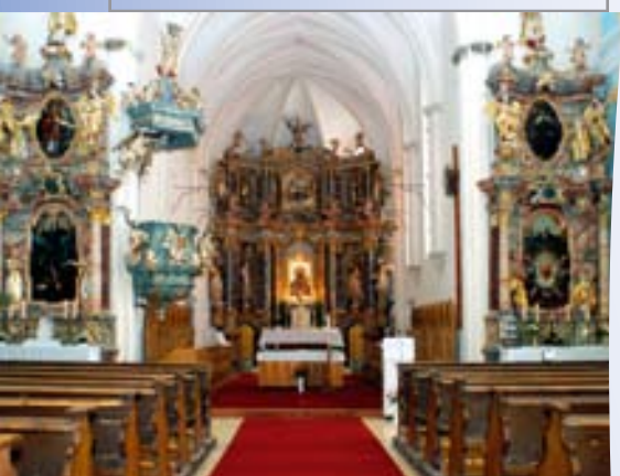
Márianosztra, baroque church