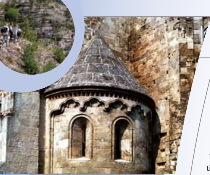
Zsámbék, church ruin detail