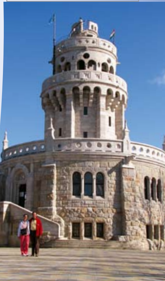
Elisabeth Lookout Tower