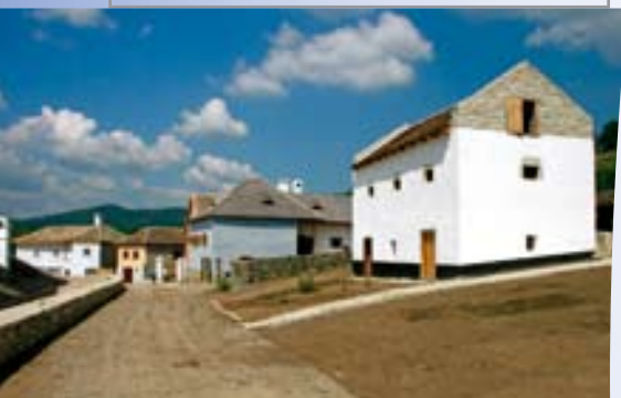
Szentendre, Open Air Museum, agricultural city of Felföld