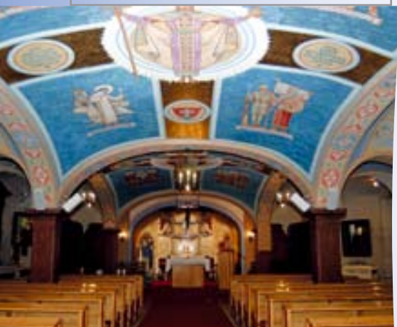
Máriabesnyő Pilgrimage Church, crypt