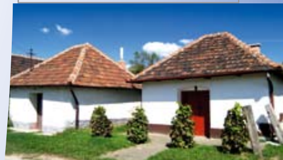
Monor, Strázsa Hill