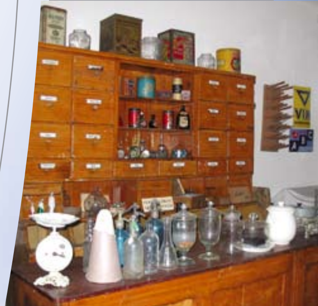
Dr István Jablonkay Local History Collection