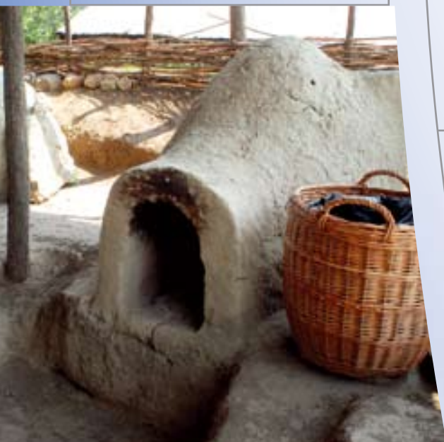
Százhalombatta, Archaeology Park

Pusztazámor (A/6) in the creek's valley is famous for a hermit chapel built in 1758 on the ruins of a Romanesque church.