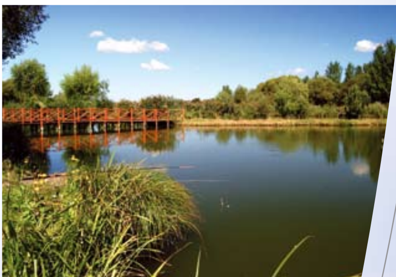
Péteri, fishing lake