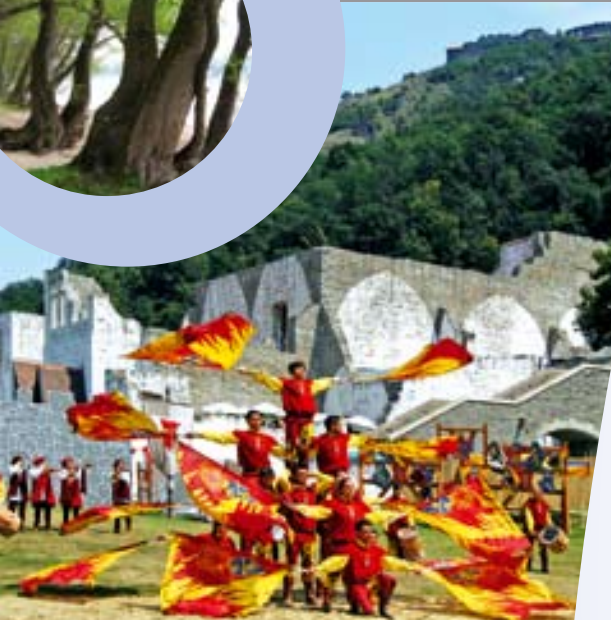
Visegrád Castle Games