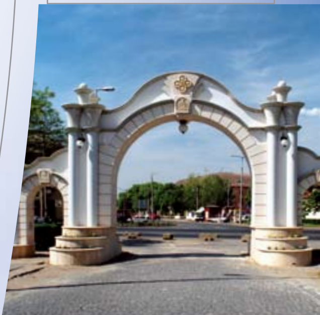
Abony, city gate