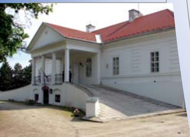
Dabas, Móricz Halász mansion

moorland. Rare plant and animal species live here in abundance – as do mosquitoes! If you wish to know more about the beauties of this area, your first stop should be the guesthouse of the Natural Reserve Area beside the reformed church. The guesthouse and the 100–150-year-old farmhouses help to paint a picture of the everyday life and celebrations of the local residents. The guesthouse even runs courses in certain popular crafts like matting and basketwork . You can also learn a lot about the life and behaviour of the region’s birds at the bird watch and in the new bird observation tower .