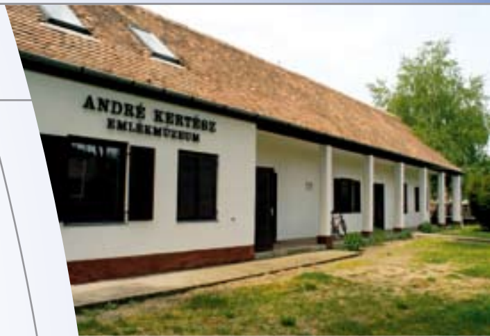
Szigetbecse, André Kertész House

Recalling the world of the Great Plain "puszta", Apaj (C/8) hosts an important event each year: the Kiskunság Shepherd and Equestrian Days . During this festival, the old shepherd and herder traditions are revived. The village also offers a riding school, and is popular for hiking and cycling tours.