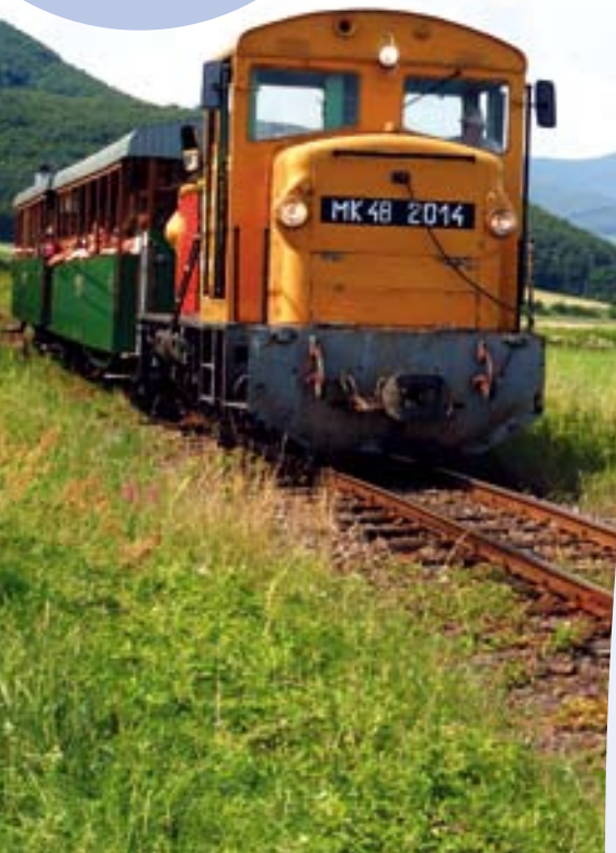
Kismaros, narrow gauge railway