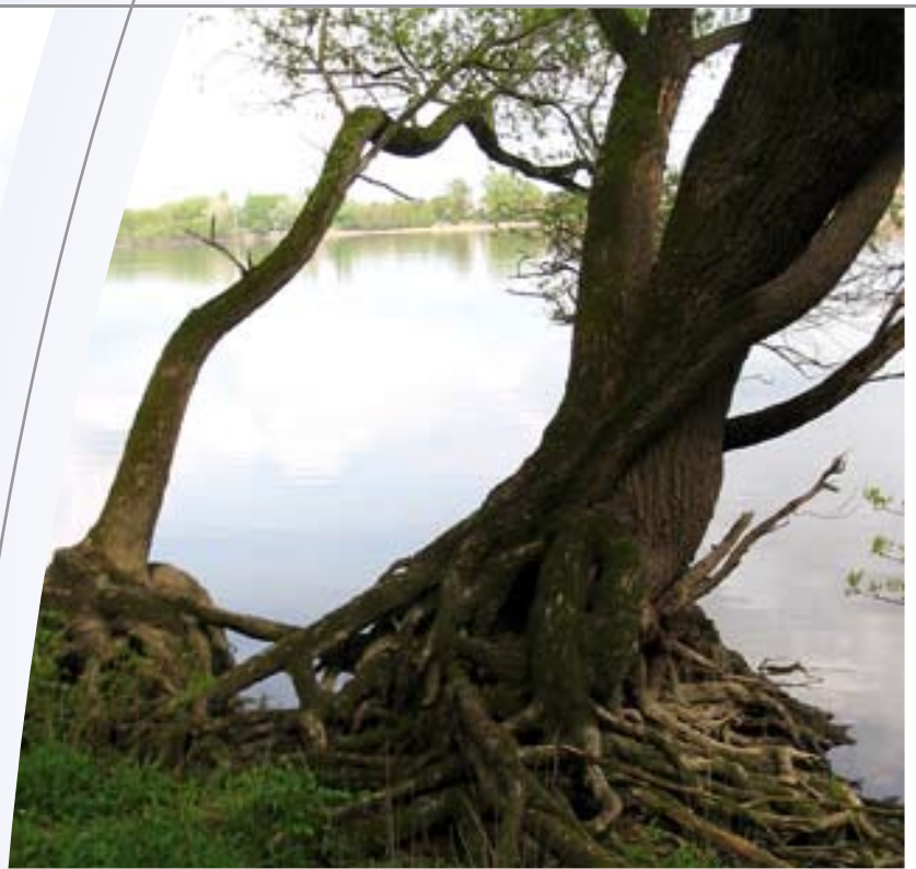
Dömsöd, Danube shore