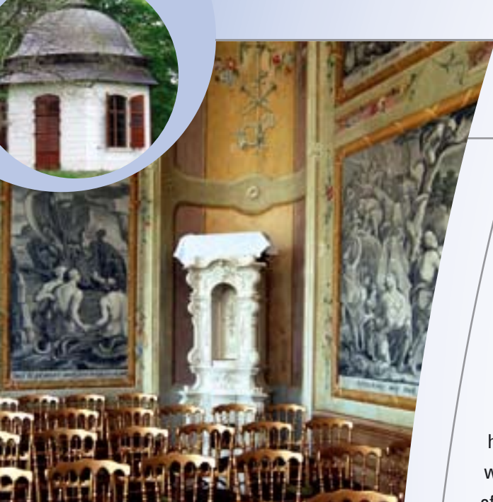
Pécel, Ráday Castle