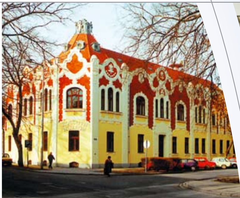
Cegléd, Kossuth Museum

facts in existence. The Kossuth Balcony – moved from Bratislava to Cegléd – is on show in the garden of the Reformed church. Needless to say, in this town the Kossuth name is everywhere – there is a Kossuth Square, a Kossuth Street and a Kossuth School. The Classicist reformed church ***, built to the plans of József Hild between 1835 and 1870, has a 60m-high cupola that makes it the tallest reformed church in Central Europe. The Sports Museum and the Drum Museum also guarantee special experiences; the latter also plays a prominent role during the International Drum and Percussion Gala. The town's newest attractions are the Thermal Bath and Leisure Centre (with its ten pools, and leisure, medical and wellness programmes) and the Aqua Centrum *** (whose old buildings are like a medieval castle and where visitors can go time travelling through 17 slides).