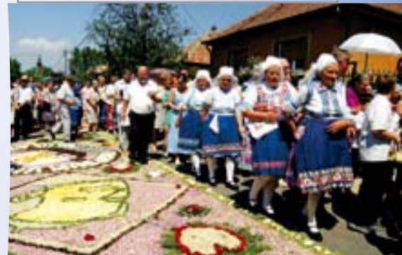
Csömör, Lord's Day Procession