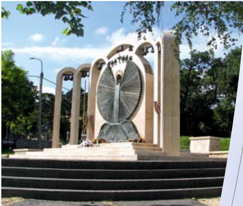
Budakeszi, Anthem statue