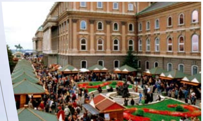
Wine festival in the Buda Castle

There are many ways to explore the city. You can go sightseeing by bus, boat or taxi. You could get a ride from a friend or take a long walk on foot. However, a tram is an especially good option in Budapest. The Danube side panorama *** can be best appreciated from tram No 2. Let's board at the Jászai Mari Square terminal on the Pest side of Margaret Bridge (avoiding the morning or afternoon rush hours) and take a seat next to the window on the right-hand side. We will soon arrive at Kossuth Square with its statues, memorials and Parliament ***, a huge palace in Neo-Gothic style. After leaving the square, we'll proceed to the Danube shore where we can admire the panorama of Buda , with the churches of Víziváros (Water town) and the Castle District , where the slim tower of Matthias Church reaches to the skies. On the journey between the historical Chain Bridge *** and the modern Elizabeth Bridge , you'll see the impressive Castle Palace and Gellért Hill's steep wall of rock. The Saint Gellért Statue is perched on the side of the hill,