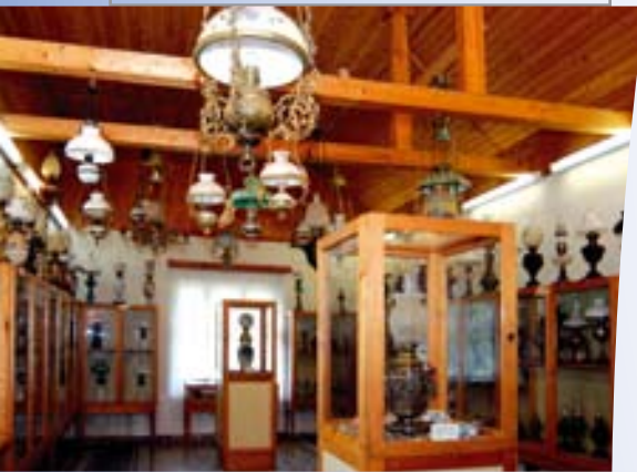
Zsámbék, Lamp Museum