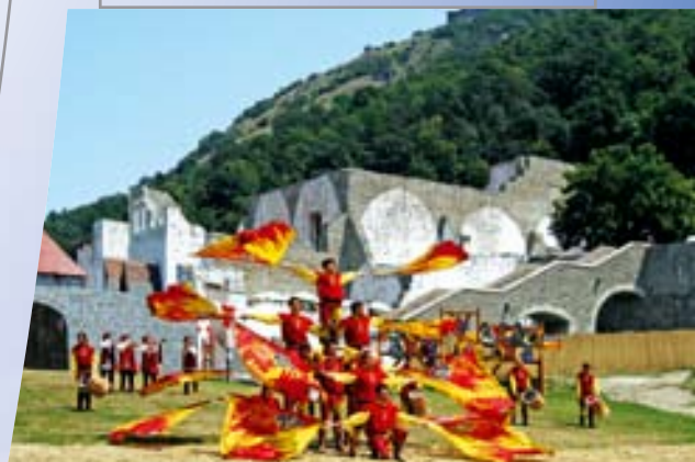
Visegrád Castle Games