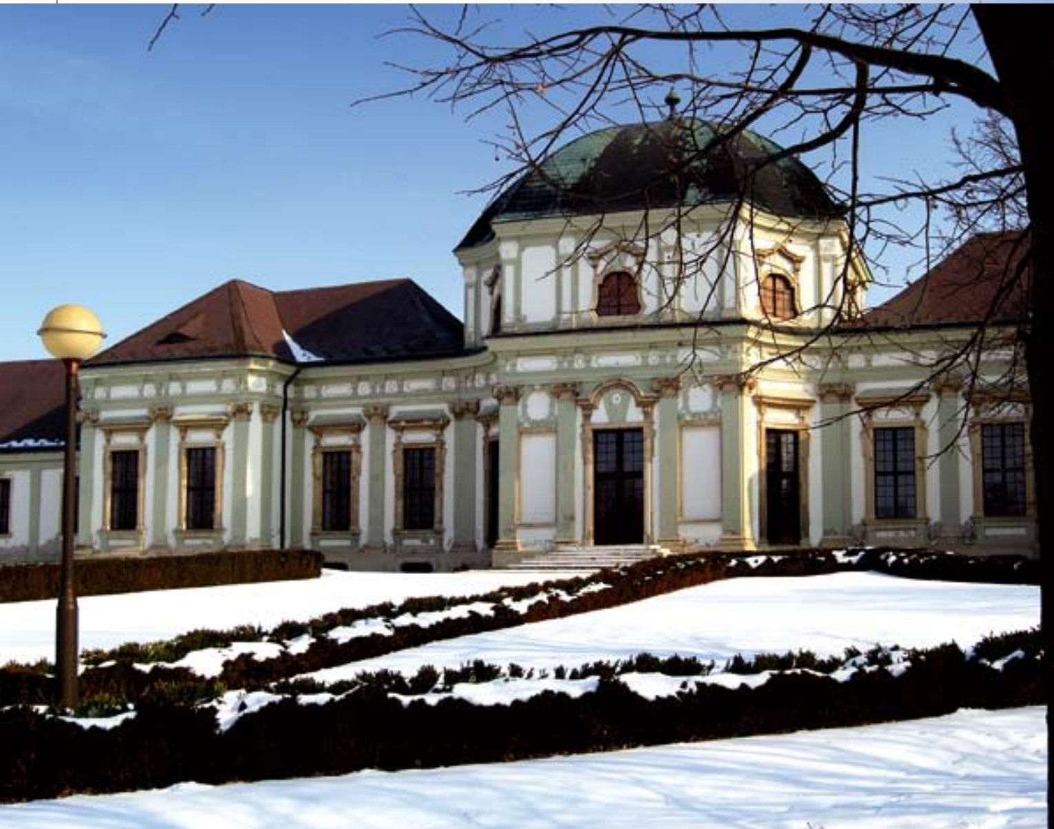
Ráckeve, Savoyai Castle

In the past, the landscape here was shaped by the Danube – and the river continues to shape it today. But it doesn't only determine the panorama; it also affects the everyday lives and celebrations of the local inhabitants. When the people in this area refer to the Danube, they mean this 50km-long tract regulated by sluice gates to the north and south. These are the Soroksár or Ráckeve Danube branches , with Csepel Island on its western (right-hand) shore and Kiskunság on its eastern (left-hand) shore. In addition to the ferries, these days bridges also connect the island with the "main land" – the bridges in Budapest, the bridges of the M0 motorway, and those of Taksony and Ráckeve. The island's settlements can be easily reached from Budapest on the HÉV train that travels as far