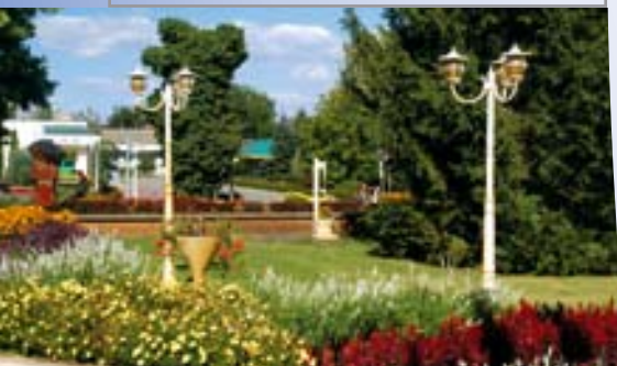
Csemő, the flowery village