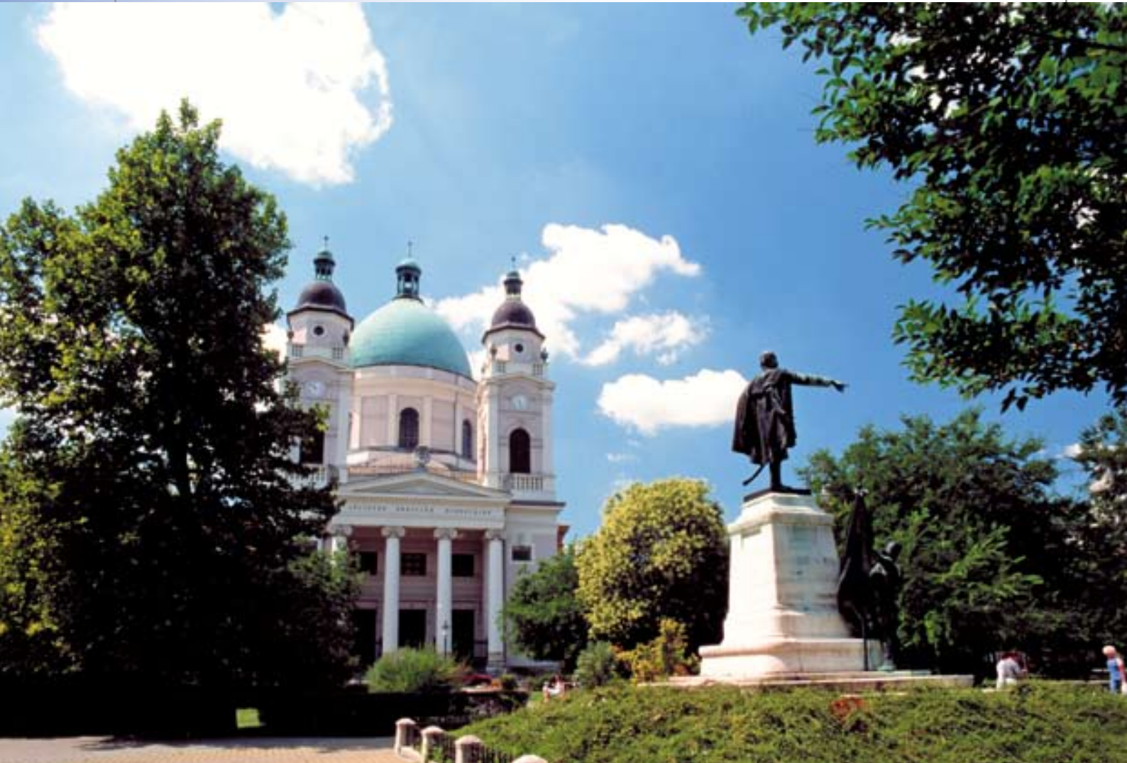
Cegléd, Classicist reformed church

In the southeastern angle of the Central Danube Region (about 100 kilometres from the capital), the traveller will find a typical Great Plain area with rich flora and fauna. The meadows and pastures, hills and valleys, are the backdrop to a rural world that is becoming increasingly rare on the Great Plains. You can learn more about the history, life and culture of the characteristic agricultural towns of the region. Furthermore, this portion of the country is readily accessed, served as it is by main roads and railways.