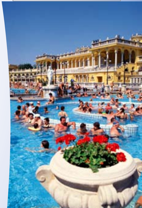
Széchenyi Thermal Baths