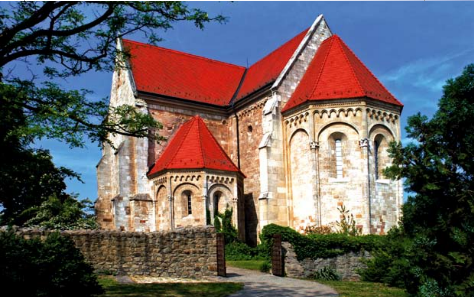
Ócsa Reformed Church

The Danube-Tisza Interfluvium and the areas near the capital were shaped by the Ancient Danube River. The present-day surface of the region resembles the Great Plains, and was formed by alluvium and pebble reefs covered with loess and sand that formed along the edges of the Danube's winding watercourses. The watercourses left moorlands – called “ turjános ” – near Alsónémedi and Ócsa, and these are valuable environmental protection areas. The region can be reached by rail and main roads (including the M5 motorway from the direction of Budapest), but it is also an ideal excursion for bikers.