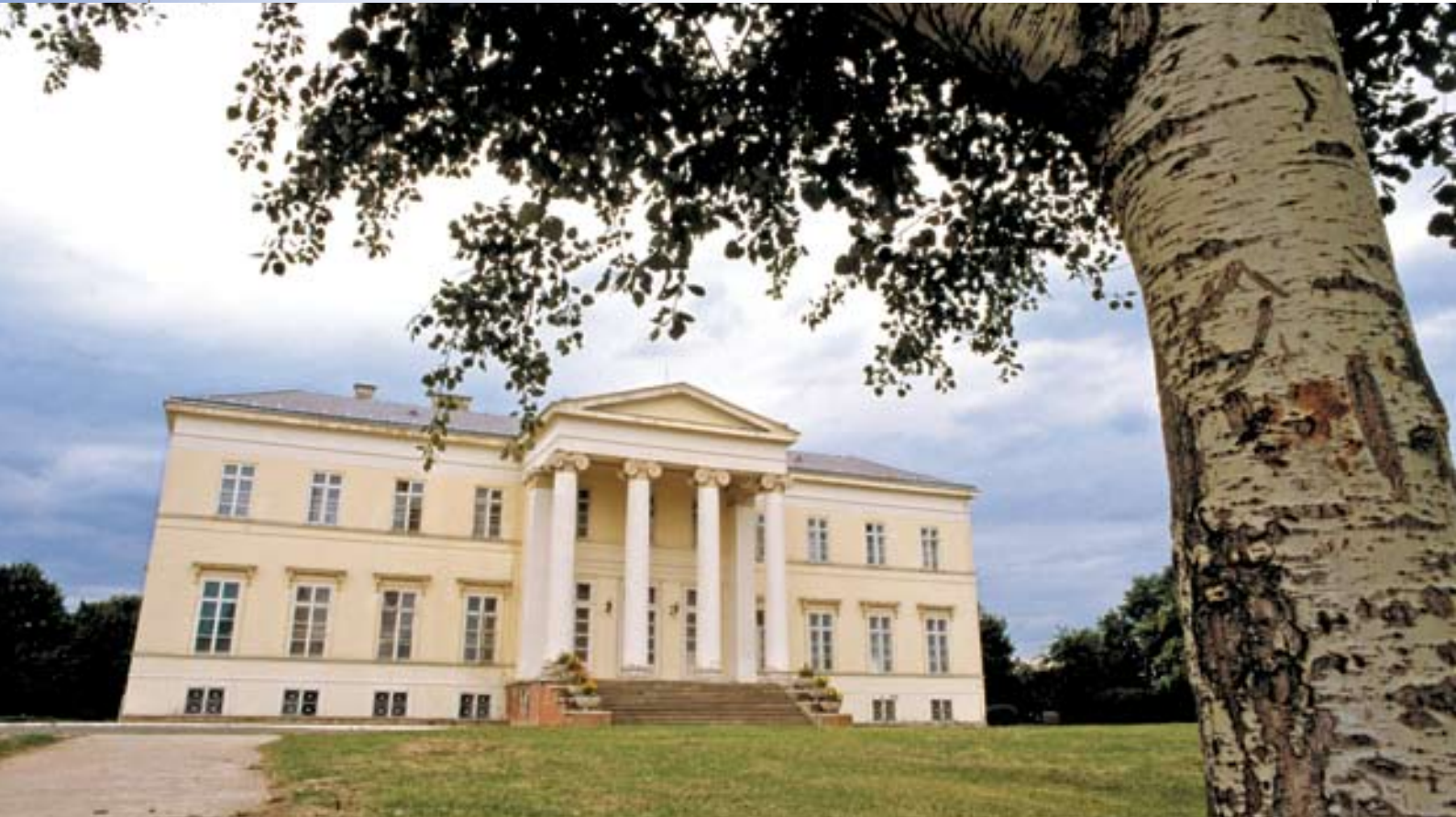
Gyömrő, Teleki Castle

We reach a smooth, flat region – the Pest Plain – where even the smallest hills are known as “mountains” by the locals. The area holds many forests typical of the Great Plain which are usually now protected areas. Road No 4 connects this place to Budapest and the country (a railway also runs parallel with it), but you can also get here via the M5 motorway. Cyclists enjoy taking tours here; there are some excellent bike routes, and the byways see only light traffic.