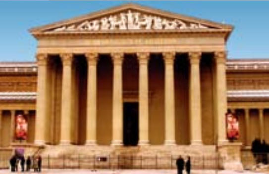
Museum of Fine Arts