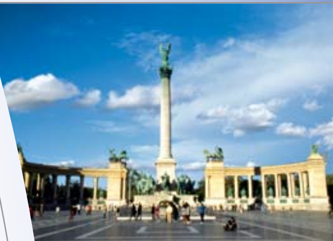
Budapest, Heroes' Square