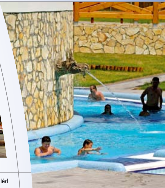
Cegléd, thermal bath

Following in the footsteps of Arany and recalling his poems, we arrive at Kőröstetétlen (F/8) ; it was from here, according to tradition, that